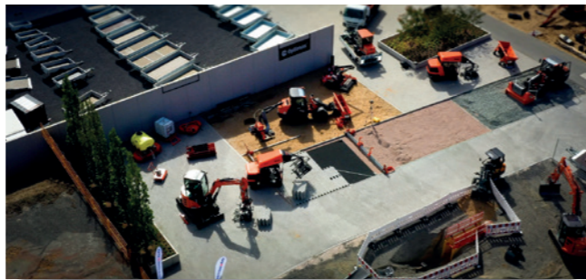
Model construction site at Coreum, Stockstadt a. R.