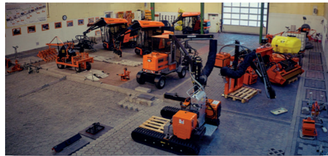
Optimas Visitor and Training Center Ramsloh