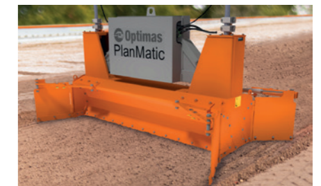
Optional: Side flaps at the front in driving direction