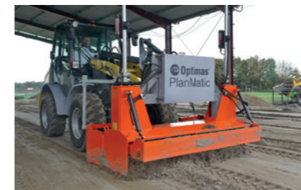
Optional: Hydraulic folding bucket